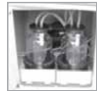
Main & Sub Suction Bottle