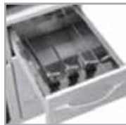
Instrument Container w/ Heating