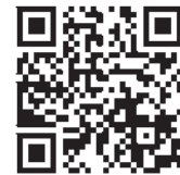
NET-1100 User manual