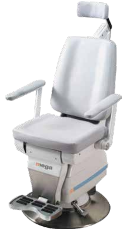
NET-1500A, B, C