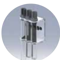
Telescope Sterilizer - Rigid 2 - Rigid 2 + Flexible 1