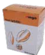
Suction tip(disposable) - 100ea, 1box