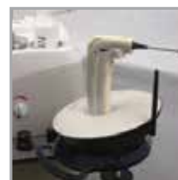
NET-280B on unit