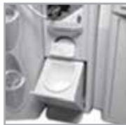
Step Type Trash Can