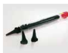
4.00 ear tip(disposable) - 25ea, 1set 2.70 ear tip(disposable) - 25ea, 1set