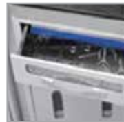
Instrument Container w/ UV Sterilizer