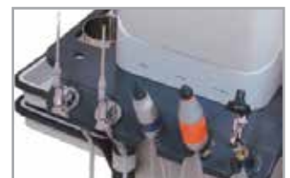
Various options for NET-1100 Operating otoscope Eustacure